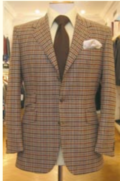
Above - A Sports Coat, 10 1/2ozs in a Gun Club Check in delicate tones of Blue/Grey and Browns on an oatmeal ground.

In 2002 Escorial was officially measured as the world's finest ever naturally grown hair or wool fibre. This very special wool from the Mahgreb flock derives its name from El Escorial, a monastery located northwest of Madrid. The Spanish Royalty took the flock there in 1340, having vanquished the Beni Merines of North Africa in the battle of Salado. In 1820 Eliza Furlonge, a Scottish wool expert took 100 of the finest Escorial sheep to Tasmania, off the South East coast of Australia. In 1987 a small flock was taken to New Zealand but it was not until the mid 1990's that the delicate processing codes were perfected. The handle is a sheer delight, soft, airy and light and remarkably good tempered because of the natural springiness of the lustrous fibre.