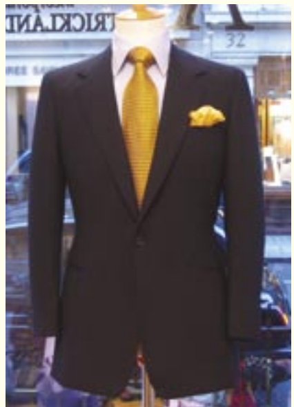
Above - Classic Richard Anderson button 1, 2 vented style, The Double Plain. Available in grey or navy.

This is a suiting we admire greatly but have not been able to obtain for some time – the rare cloth is so unique and special that we decided to purchase the entire supply for our customers when it recently became available. Extremely complex to weave, the double plain worsted has a full rich handle and is a delight to wear. It has an elegant fine rib and is available in navy, dark navy and dark grey. This is a unique opportunity to purchase the last of a truly beautiful cloth.